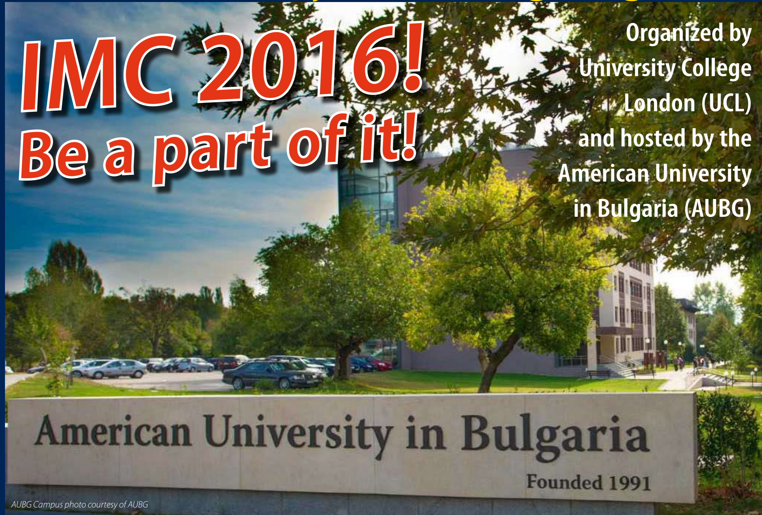
AUBG Campus

Each participating university is invited to send several students and one teacher. Individual students are welcome. The competition is planned for students completing their first, second, third or fourth year of university education and will consist of 2 Sessions of 5 hours each. Problems will be from the fields of Algebra, Analysis (Real and Complex), Combinatorics and Geometry. The working language will be English.